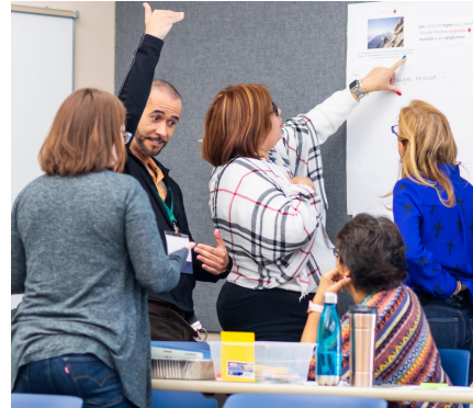
Below: Members of SWTESOL of Florida Local Chapter, February 29, 2020